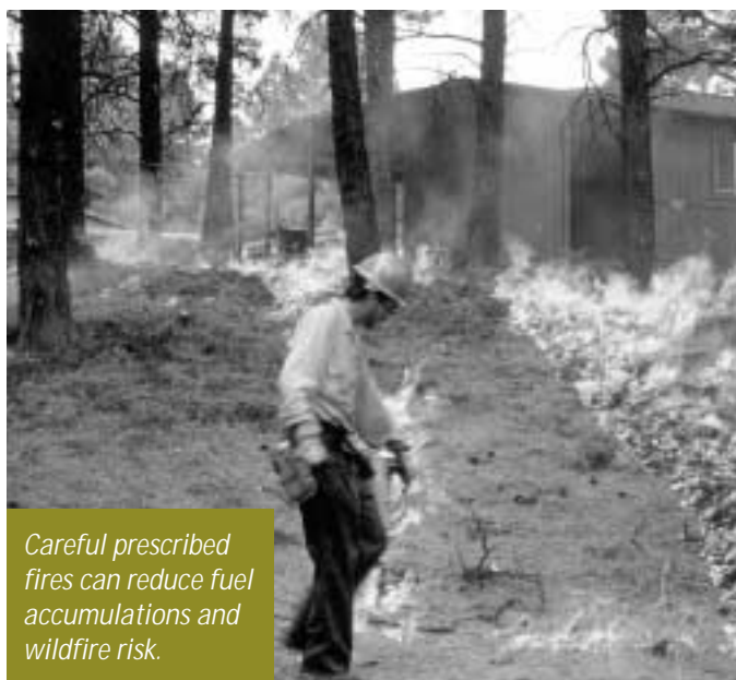
Careful prescribed fires can reduce fuel accumulations and wildfire risk.